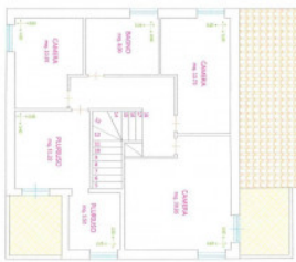
PIANTA PIANO PRIMO